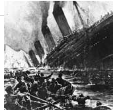
It took the tragedy of the Titanic to reveal just how vital an universal distress system was

In the Times Archive: on July 2, 1909 wireless telegraphy saved the Cunard liner Slavonia